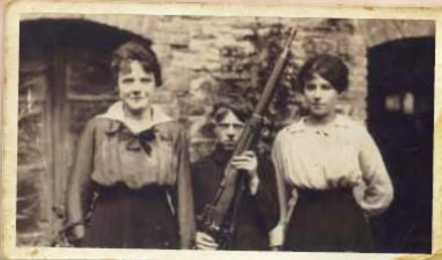
What 322nd Field Artillery Regiment Doughboy thought it was a good idea to impress these two mademoiselles in Messac (most likely Massac), France, by letting their friend pose with his M1917 Enfield? Hopefully, the First Sergeant was busy elsewhere!