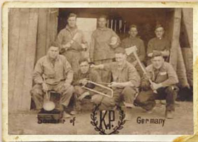
This image gives us an idea of what passed for humor in the mess sections of the Big Red One. Brandishing all of the sharp tools of their trade, these Doughboys of the 1st Division threaten each other playfully. During the occupation of Germany, many 1st Division photos portrayed the Division's symbolic number "1" inside a wreath and these soldiers have replaced it with their current assignment: Kitchen Police.