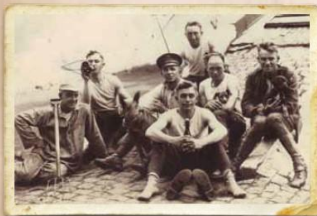
Nothing says "good times" after mucking out the AFG Mounted Detachment horse stables like taking your boots off, gathering your dogs, and having a beer while sitting on the cobblestones. Knowing that LTC Jonathan Wainwright (later General Wainwright in the Philippines) commanded the detachment and was a strict disciplinarian, what were they thinking?