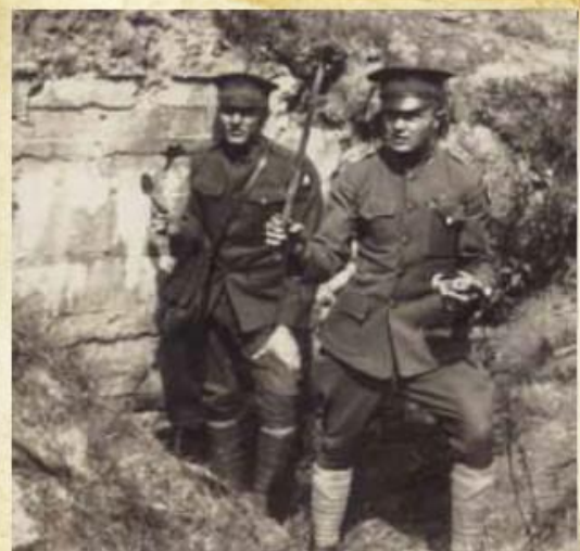
Among the many off-duty pursuits of the US soldiers assigned to the Occupation of Germany in the early 1920s were trips to visit the battlefields of the Great War. Here two well-uniformed soldiers emerge from an old bunker brandishing a bayonet, a bottle, and a spoon. With most of the battlefields in France still covered with live ammunition of all sizes, such exploration was probably not the smartest way to spend their leisure time.