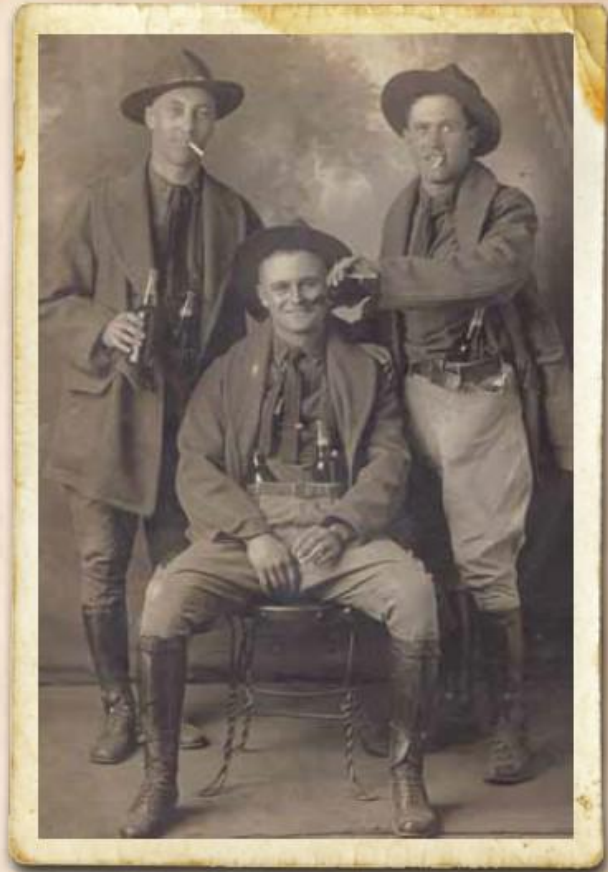
Marked only with the words "That last night in San Antonio," this group of happy 90th Division Doughboys certainly give the impression that they are well equipped with tobacco and alcohol, and ready to face the Kaiser's Army. They would get that chance soon enough at St Mihiel and in the Argonne.

For the Doughboys of World War I who were training in the States or serving in France and Germany, there were no end of opportunities to take pictures — and leave us wondering the same thing. Here are just a few that leave us wondering, "What were they thinking?" ❖