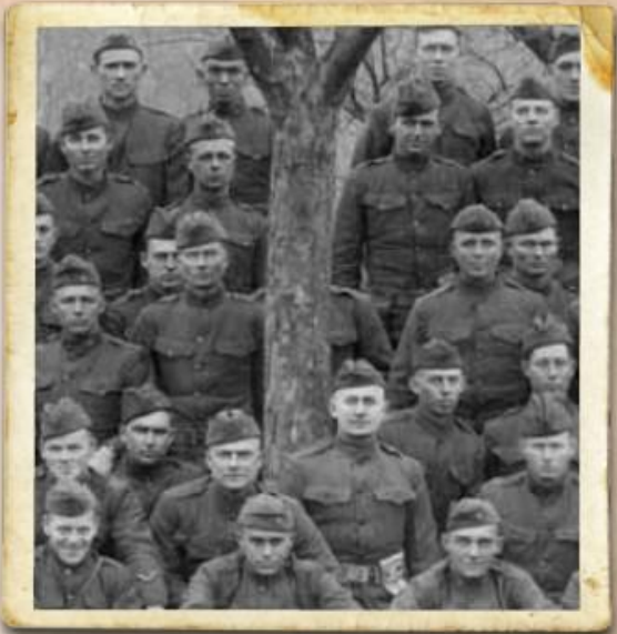
More 90th Division humor or accidental placement? The artillerymen from Battery "F", 345th Field Artillery Regiment, pose for a "yard-long" photo. The soldier in the center behind the tree was either the unit comedian or just unlucky; either way, he had to know he was not going to be in the photograph. What was he thinking?