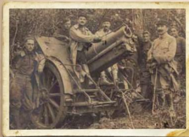
A solemn group of 37th Division artillerymen and their French 5th Regiment comrades pose with a captured German field piece. Only the Doughboy on the far right seems to see the humor in the pose of the Frenchman seated on the cannon barrel.