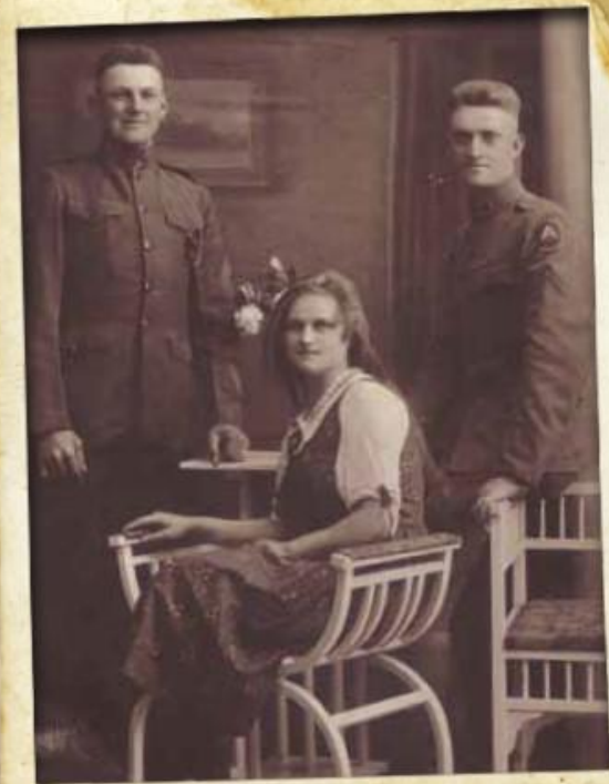
These two American Forces in Germany (AFG) NCOs have chosen to spend their time getting a portrait made with a German Fräulein. While the soldiers appear to be at their best, and now wearing rank also on their left sleeve, the German girl appears to be experiencing the "worst hair day ever." What was she thinking?