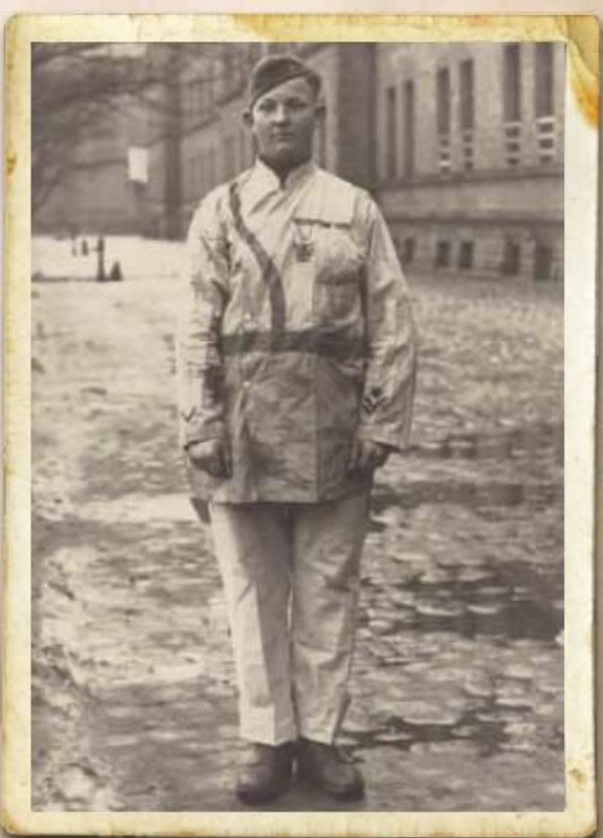
A real head-scratcher; this orderly from the 19th Evacuation Hospital, located near Trier, Germany, has decorated his white over-garments with a Sam Browne belt, Croix de Guerre, a row of ribbons, two overseas stripes and an "early arrival in France" star.