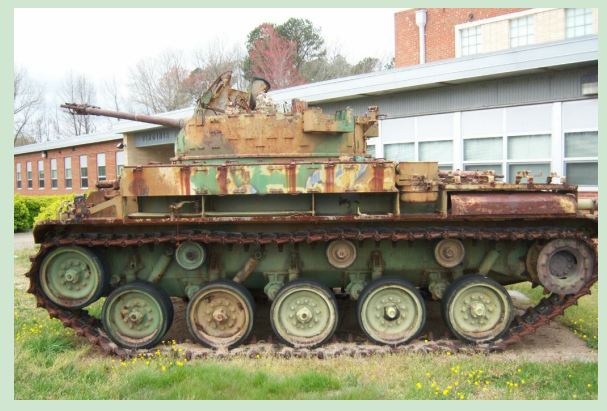
The M-42 Duster (twin 40mm) was a key