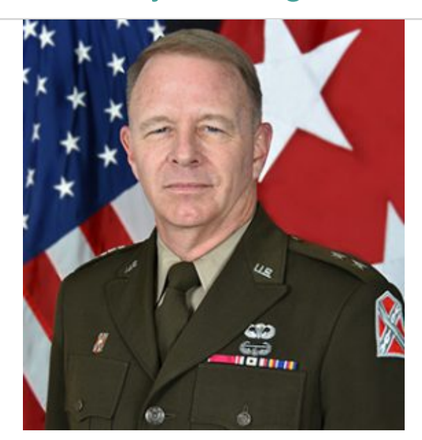
Click the photo above to see a video presentation of this message.

We also owe a special thanks to our employers and everything they do to accommodate our busy training schedules. They are true patriots, and their continued support is critical to our mission.