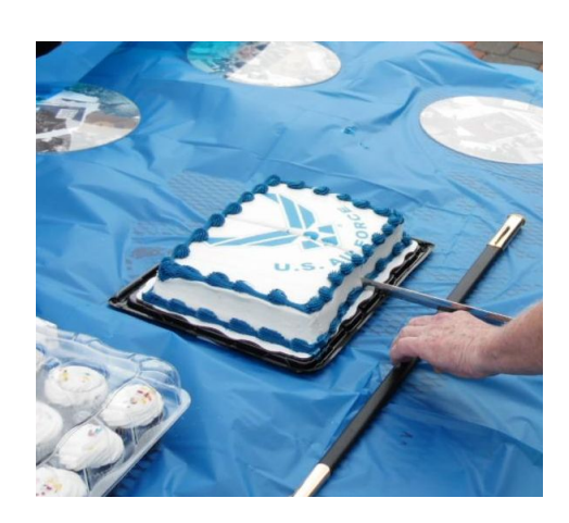
The ceremonial cutting of the cake to celebrate the <u>73rd birthday</u> of the <u>US Air Force</u> as a separate military service (18 Sept 1947).