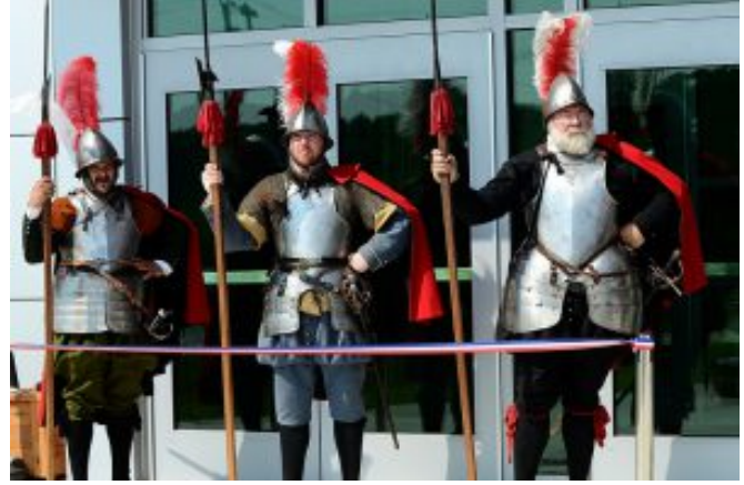
Historical interpreters from Jamestown at the ribbon-cutting ceremony for the Virginia National Guard's newly-built Joint Force Headquarters building May 14, 2018, at Defense Supply Center Richmond in Chesterfield County, Virginia

Connect with our shared history: Facebook page Official website